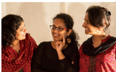
Third Step: “reintegration”