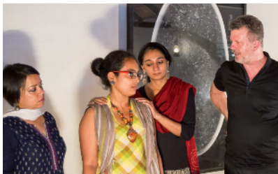
First Step: “warming up”