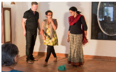
Second Step: “action”